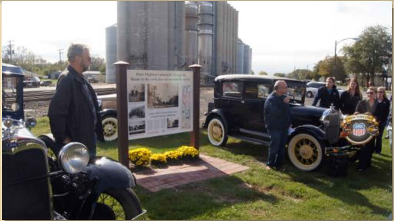
Grant Park, IL